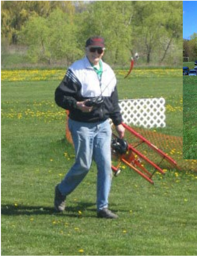
If I could just get it off the grass, it might fly...