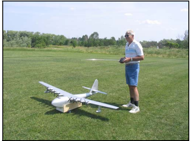
Laddie's Spruce Goose. The steerable take off trolley was more complicated than most of our aircraft! It even worked.