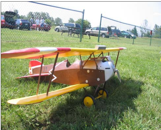
Laddie Mikulasco's beautiful little biplane flew like a dream....but landed like a WW1 biplane. (see below)