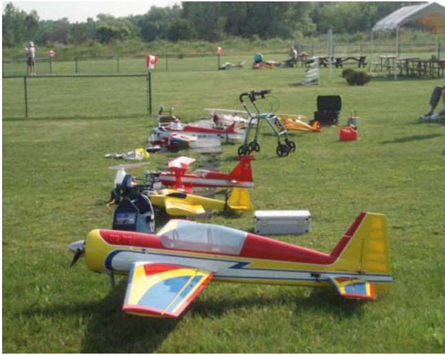
Some of the "Iron" ready to fly