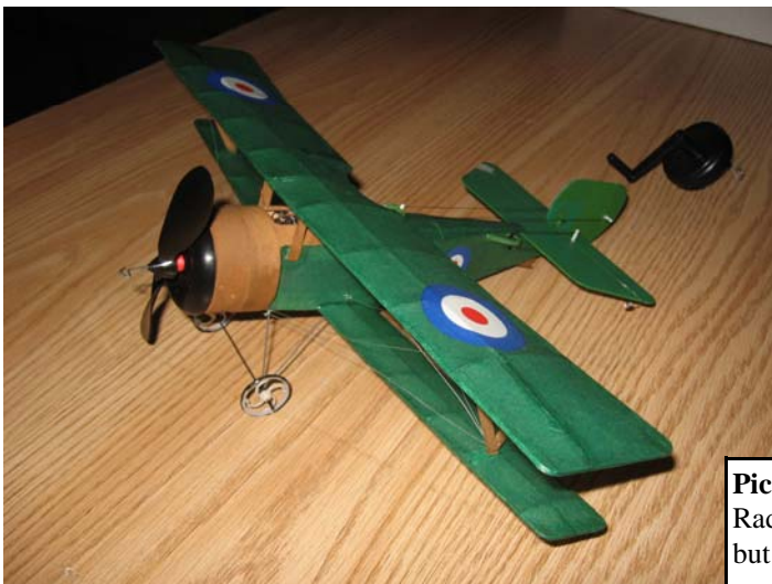
Pictured to the Left. Dave Pengelly's Rubber Powered but Radio Controlled model. Not legal for The Great Rubber Race but could be a harbinger of things to come.

the fall when we will write the rules. As usual it was all a bunch of fun.