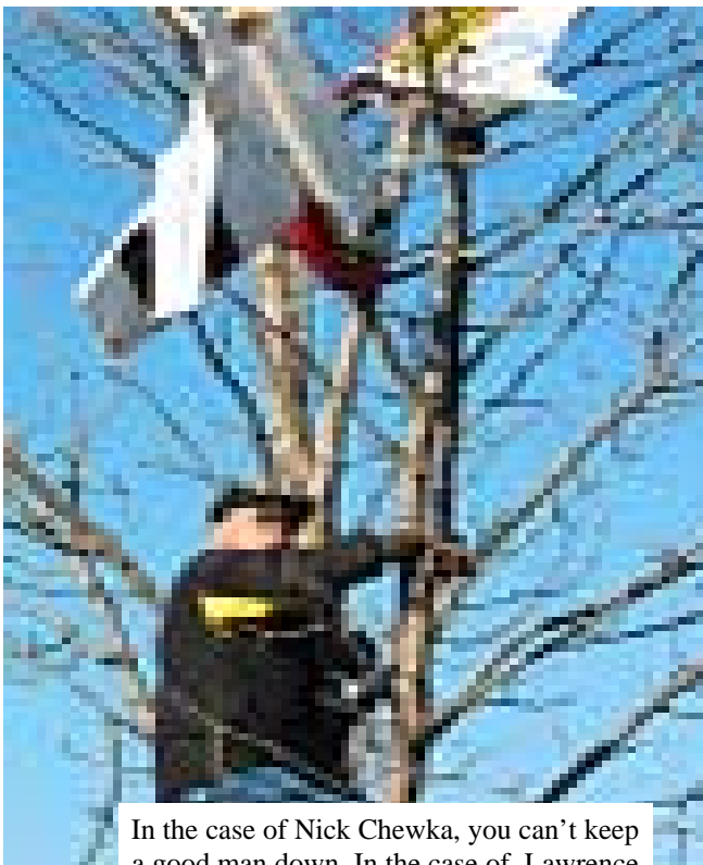
In the case of Nick Chewka, you can't keep a good man down. In the case of Lawrence Cragg's airplane sometimes you get a good plane down.