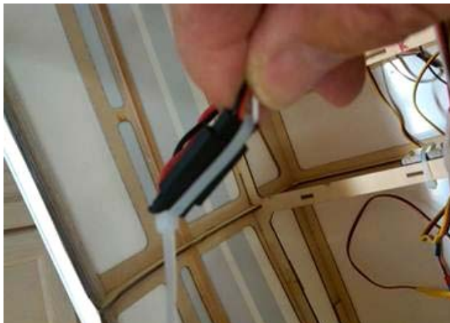
Now That's a good idea!

Don't forget....Bring a plane (or something) to the November Meeting