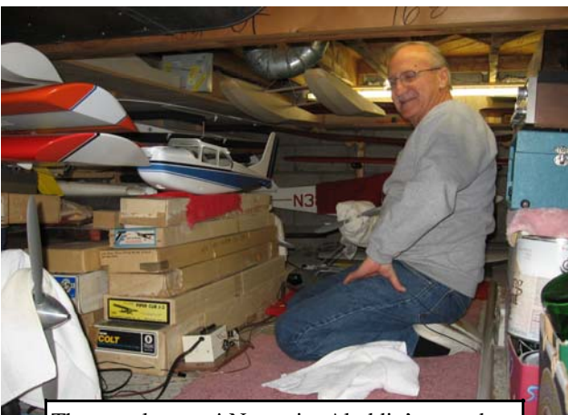
The crawl space! Not quite Aladdin's cave but, for an enthusiast, close.

As for building, there is a vicious rumour that Charlie,