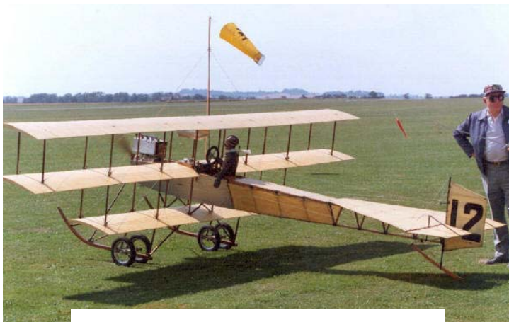
50% Avro 1 (212 cc engine)