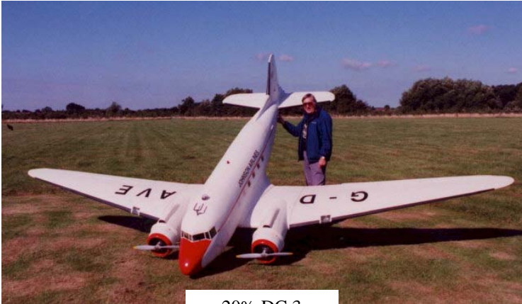
20% DC 3