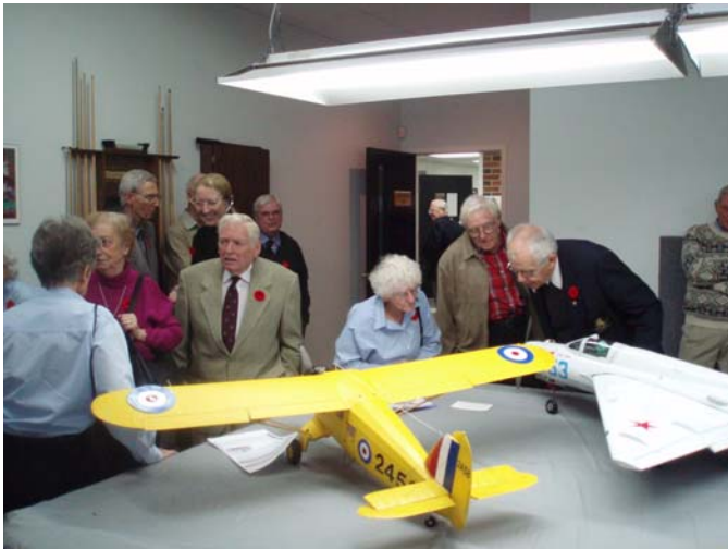
Card McGill's Nordyn N 1000

Modelers were asked to present a static display of military aircraft from all eras for their Remembrance Day ceremonies at the Ontario, Ancaster Senior Achievement Centre. We had 9 members with a variety of military style air-