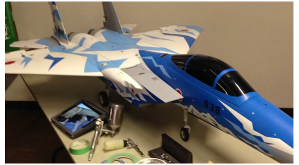
At the May meeting.