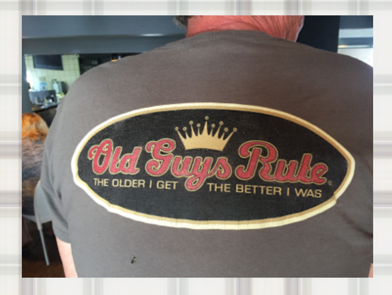
Two pictures to fill the space. This is a hint that I am looking for content