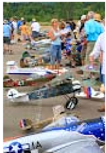
The mid-day Runway show at Warbirds