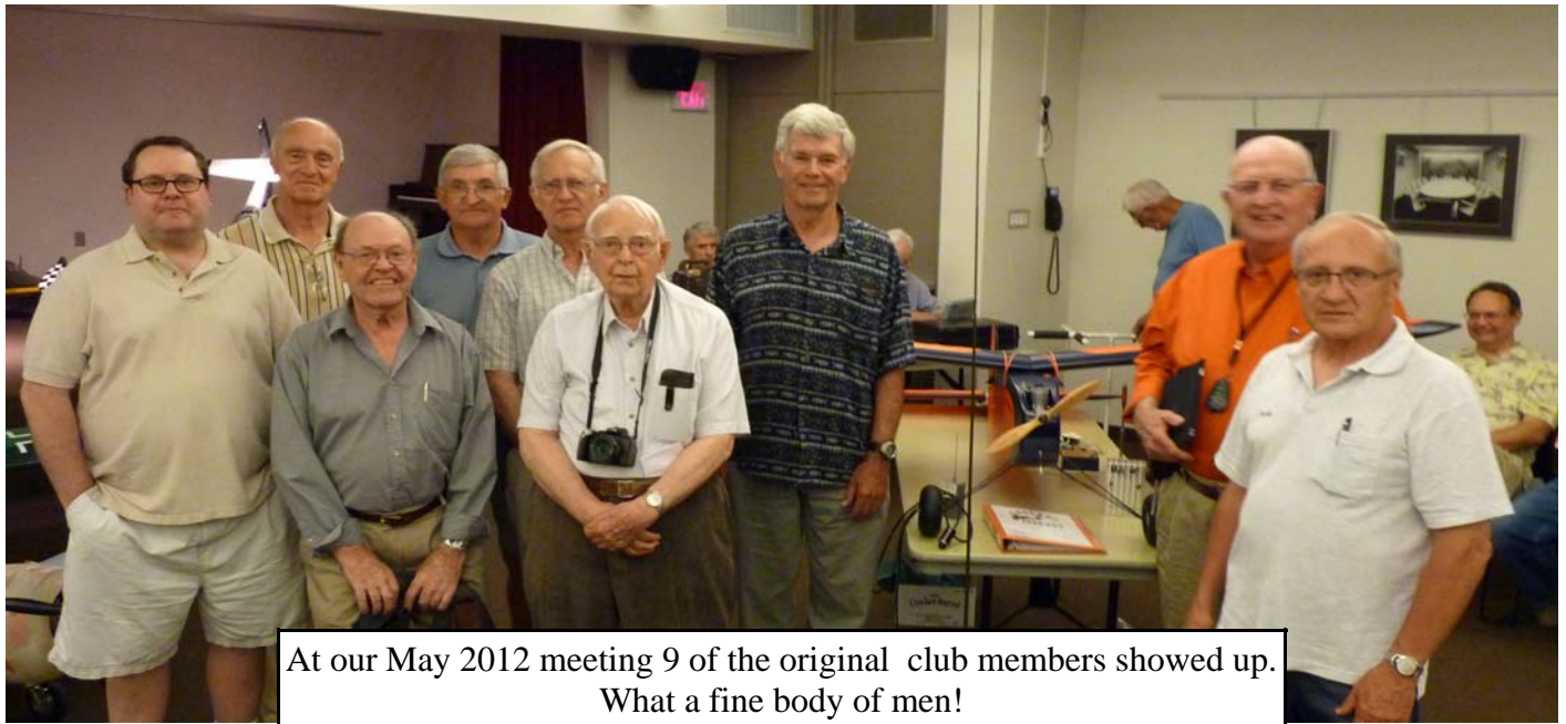
At our May 2012 meeting 9 of the original club members showed up. What a fine body of men!