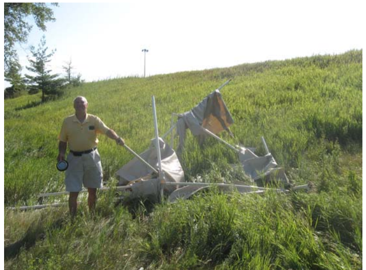
Above. A freak wind took the Chicky at Bronte and dragged it about 200M towards the QEW before leaving it in a twisted mess. (Carl Finch is on the left, the twisted mess on the right), Bronte Park have provided us with a free replacement, even put it up for us!